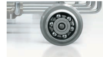
EasyGlide™ rack system

This state-of-the-art system uses an advanced scanning-eye sensor to literally look at the level of soil in the wash water, and adjusts both the water temperature and length of the wash cycle to eliminate redeposits. It can also determine if a secondary, fresh water fill is necessary, deleting the cycle whenever appropriate to save water and energy.