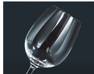
After softening the water