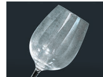
Hard water deposits

Hard water is tough on dishes—and your dishwasher. If you live in a hard water area, glasses may come out looking cloudy or spotted, and your dishes may not get as clean as they should. That's why select 300 Series and ADA dishwashers offer a built-in water softener, which removes hard water spots caused by lime deposits and softens the water to appropriate levels for spot-free, shiny dishes.