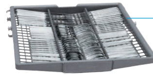
Standard 3rd rack

Provides the perfect space for flatware, large utensils, measuring cups, or nearly anything else that's difficult to fit in a traditional dishwasher, while its V shape leaves room below both sides for taller items like stemware in the middle rack. Available on all 300 Series models.