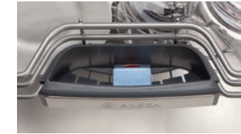
Rack-mounted detergent tray

Optimized for tablets, our detergent tray holds tabs in place for a dedicated spray jet to directly dissolve them completely. This not only results in a deeper clean, it also helps to reduce unwanted noise since there's no water jet spraying the inner door. (Dishwasher also works with powder and gel.)