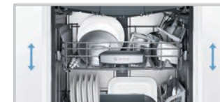
RackMatic® adjustable rack

MyWay™ offers more room for more kinds of items in the top rack, such as cereal bowls, whisks, tongs and large measuring cups, creating more freedom in loading below. Available on all 800 Series Premium models.