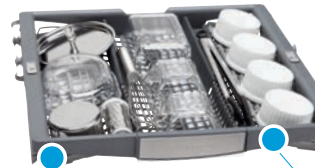
Flexible 3rd rack

Provides the perfect space for flatware, large utensils, measuring cups, or nearly anything else that's difficult to fit in a traditional dishwasher, while its V shape leaves room below both sides for taller items like stemware in the middle rack. Available on all 300 Series models.