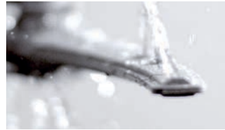
Sensor wash system

Optimized for tablets, our detergent tray holds tabs in place for a dedicated spray jet to directly dissolve them completely. This not only results in a deeper clean, it also helps to reduce unwanted noise since there's no water jet spraying the inner door. (Dishwasher also works with powder and gel.)